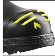
HAIX® High Durability Cap System