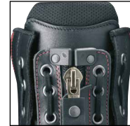
HAIX® Lacing System