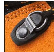
HAIX® 2-Zone Lacing