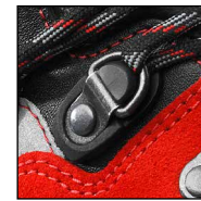
HAIX® 2-Zone Lacing